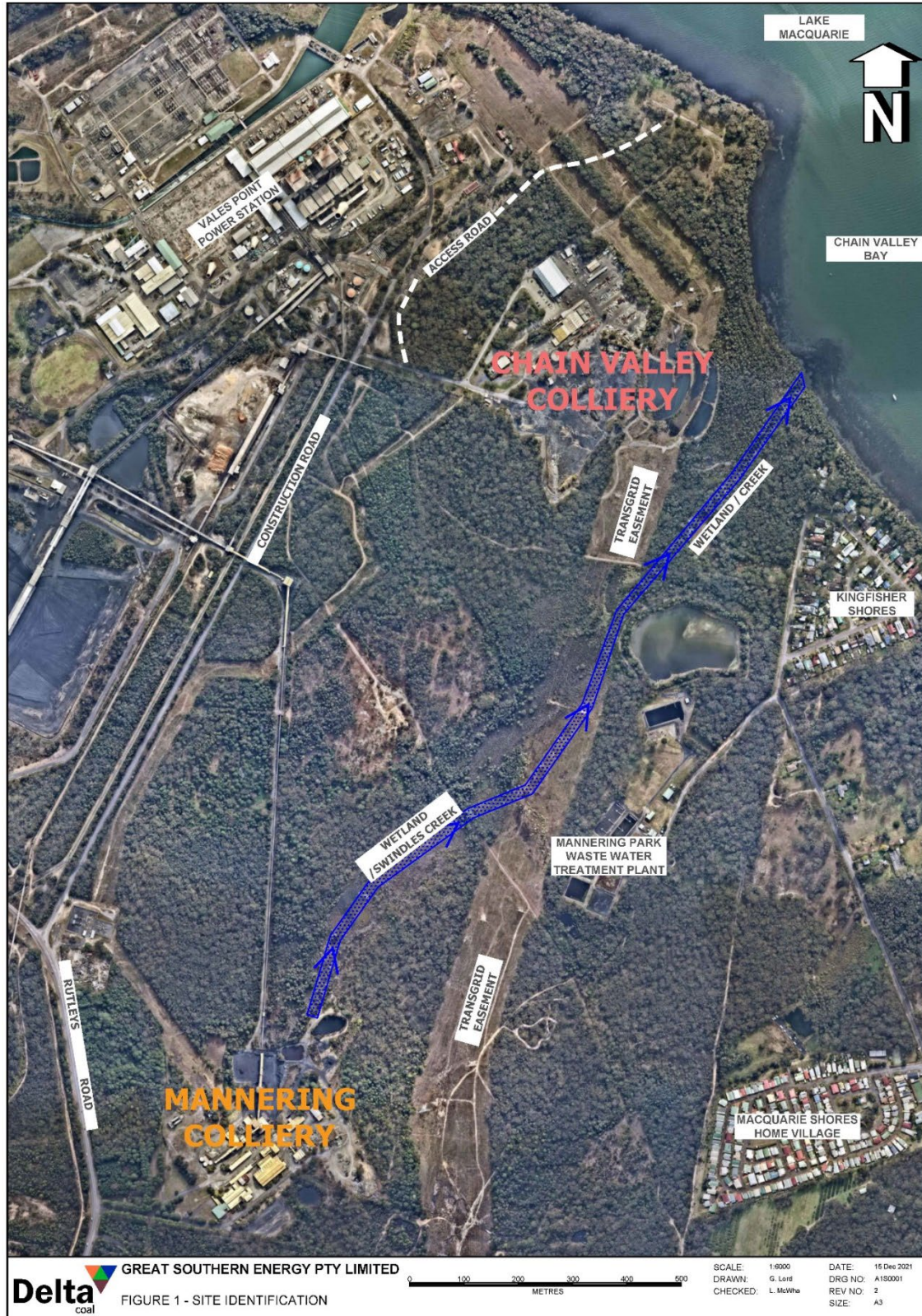
Figure 1 – Mannering Colliery Site and Surrounds